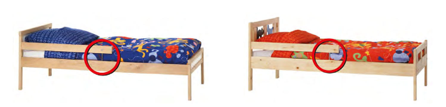
KRITTER and SNIGLAR Junior Beds Recalled on August 15, 2013

The metal rod connecting the guard rail to the bed frame can break while in use, posing a laceration hazard. The beds were sold exclusively at IKEA stores nationwide and online at www.ikea-usa.com from July 2005 through May 2013.