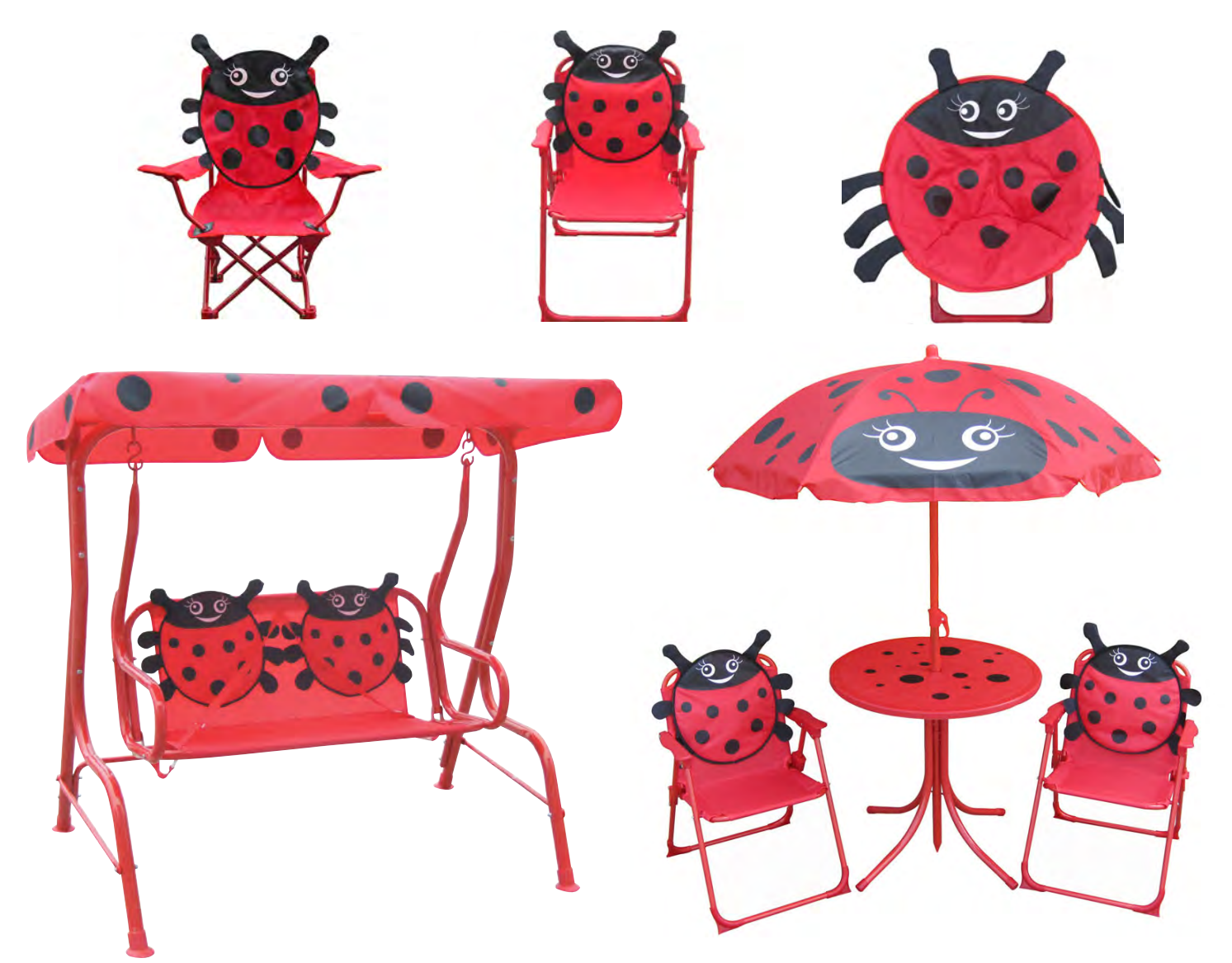
Leisure Ways® Brands Kids Outdoor Furniture Recalled on July 31, 2013

The red surface paint on the furniture contains excessive levels of lead, in violation of the federal lead paint standard. The furniture was sold at Weis Markets, wholesale distributors, grocery and drug stores nationwide from January 2013 to May 2013.