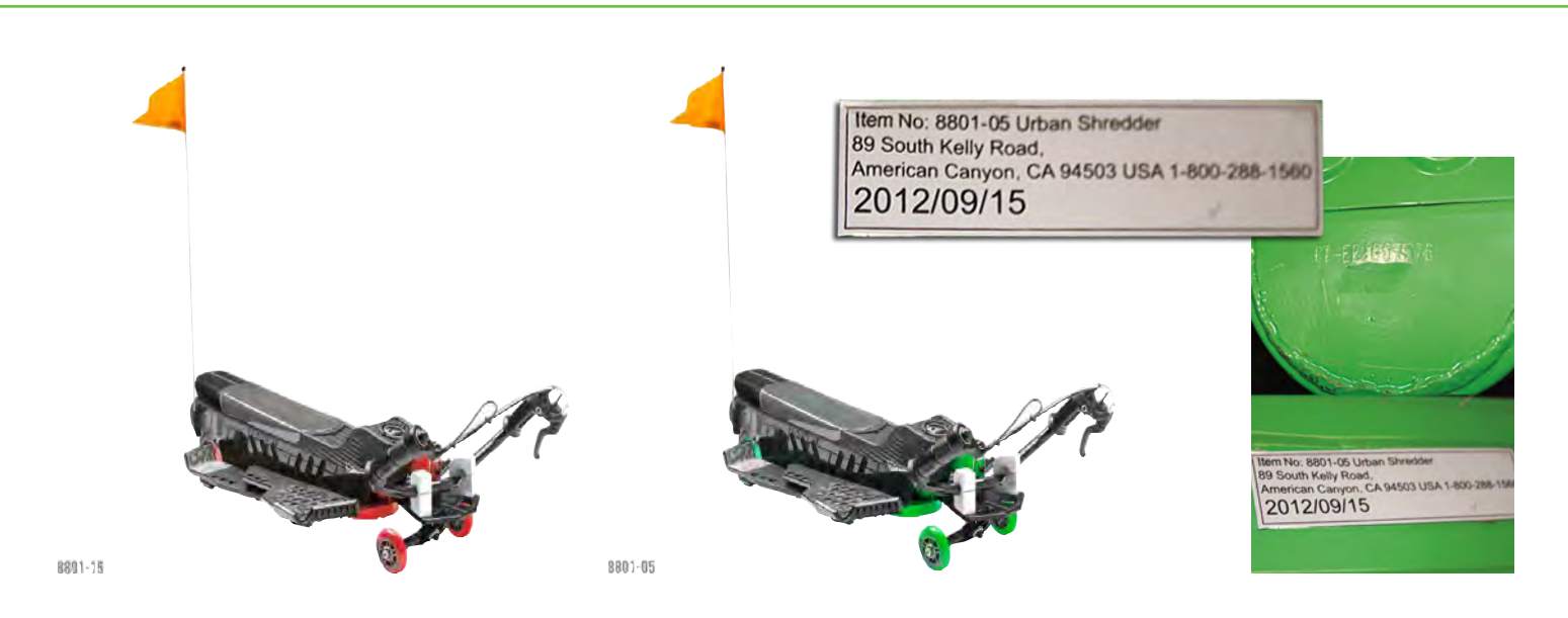
Urban Shredder Ride-On Toys Recalled on April 4, 2013

The Urban Shredder ride-on toys can unexpectedly accelerate and cause the rider to lose control, posing a fall hazard. The toys were sold at Target, Toys R Us and Walmart stores and online at amazon.com, target.com, toysrus.com and walmart.com from November 2012 to February 2013.